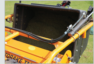
Large capacity collection box, shown with optional hydraulic tip kit