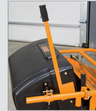
Easy to use manual tip system